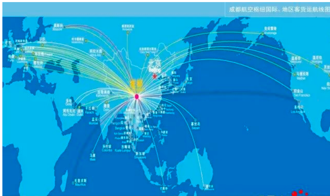
Figure 3. International and regional passenger and cargo routes for Chengdu Airlines hub in 2017

space channel of East-West communication changed from continent to sea, and the continental transportation center in the West also shifted to the eastern coast, thus the Shu brocade declined. In the Ming Dynasty, the consumption and export of Shu brocade were greatly affected by the sale of Dongyang cotton introduced into China by the sea. In the Qing Dynasty, the tense situation of internal blockade and foreign invasion made Shu brocade almost withdraw from the commercial market (Figure 3).